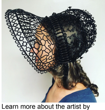
Learn more about the artist by clicking on the photo