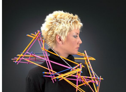
Learn more about the artist by clicking on the photo

Instructions: Using whatever materials you can find at home, create something <u>wearable</u>. Be creative in your choice of materials. Consider difficulty of use, humor, and how comfortably the result can be worn. You may decide to combine materials, but bonus points to limiting the variety of materials you will use.