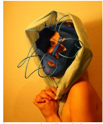
Learn more about the artist by clicking on the photo